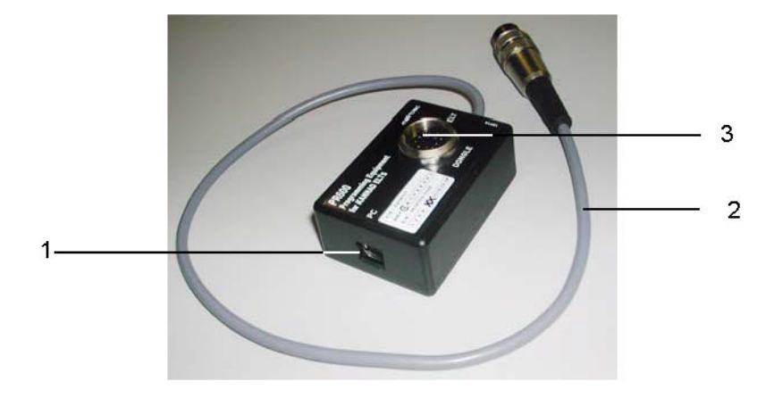
Figure 2: PR600 Programming interface module